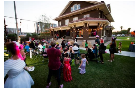
Annual Ghostly Stories Family Literacy and Storytelling event, 2016

Learn more about Arizona Humanities programs at www.azhumanities.org and visit us at 1242 N. Central Avenue, Phoenix, AZ 85004.