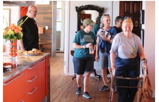
Urban Tour visitors