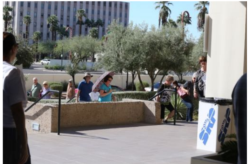
Urban Tour visitors